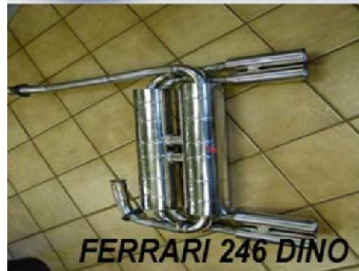
FERRARI 246 DINO