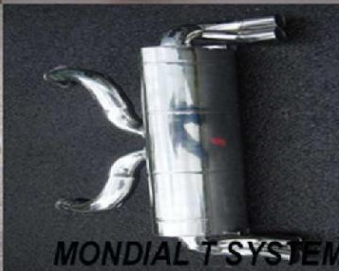
MONDIAL T SYSTEM