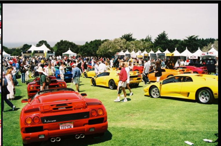
Photos from the field of last year's Lamborghini National Meet in Monterey