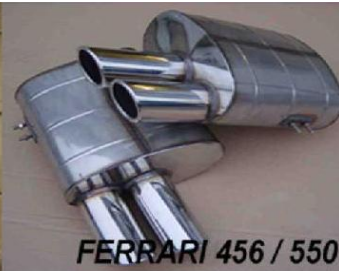
FERRARI 456 / 550