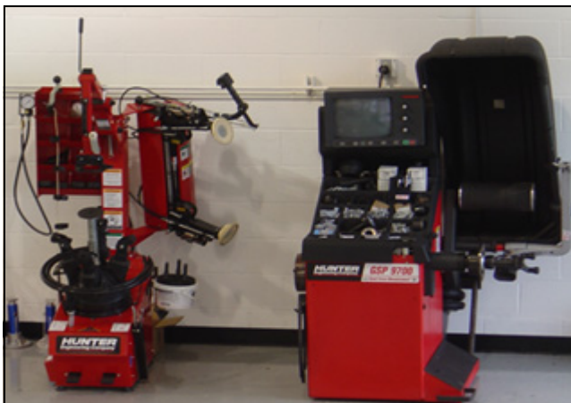
Hunter's TC3500 Tire Changer and the GSP9700 Road Force Wheel Balancer