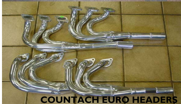
COUNTACH EURO HEADERS