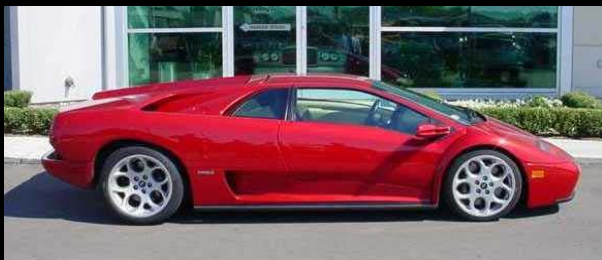
2001 Diablo 6.0