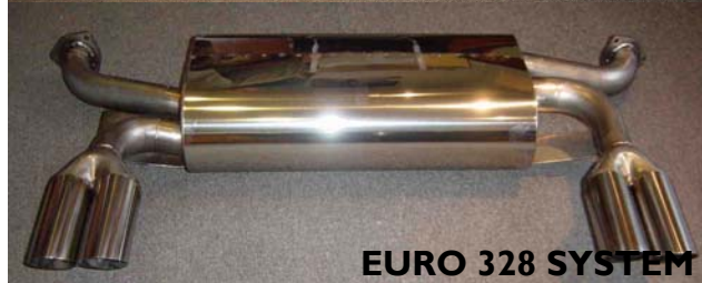
EURO 328 SYSTEM