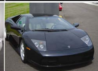
2002 Lamborghini Murcielago Black, 6-spd. $199,900