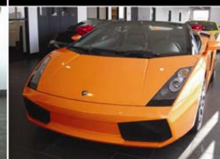
2006 Gallardo Spyder Pearl Orange, 6-spd. $214,900