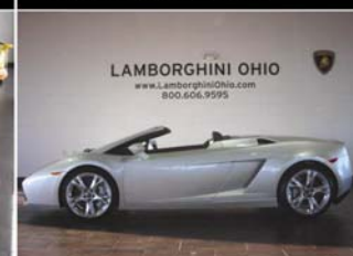
2006 Gallardo Spyder Pearl White, 6-spd. $214,900

We have a large assortment of in-stock Lambo Boutique apparel and accessories available for quick delivery.