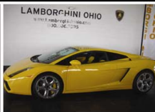
2005 Lamborghini Gallardo Yellow, E-Gear. $169,900