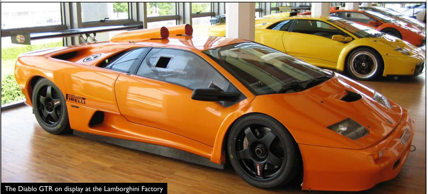
The Diablo GTR on display at the Lamborghini Factory