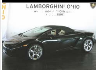
2006 Gallardo Spyder Dark Green, E-Gear. $212,900