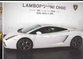
2006 Lamborghini Gallardo White, E-Gear. $195,900