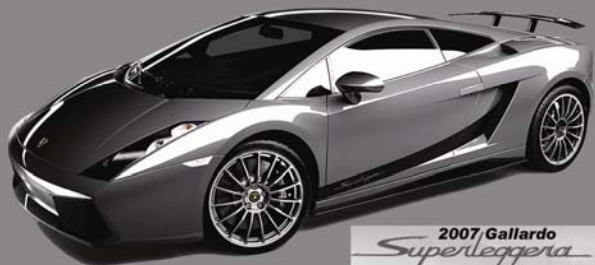
2007 Gallardo Superleggera

Lamborghini Ohio's 75-car, indoor showroom is the largest Lamborghini facility in the country. We specialize in the sale and service of Lamborghinis and other exotic and luxury cars of distinction. Each of our vehicles are as exceptional as the clients we serve. Our factory trained, master technicians ensure your Lamborghini, exotic, or luxury vehicle is fixed correctly the first time. Ask about aftermarket cosmetic and power upgrades - our specialty!